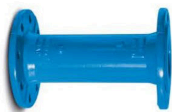
FFG double flanged pipe