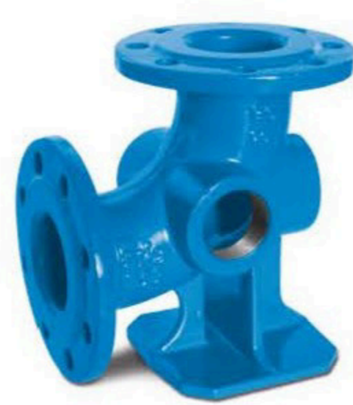
NI 3x2'' flanged 90° duckfoot bend with bosses