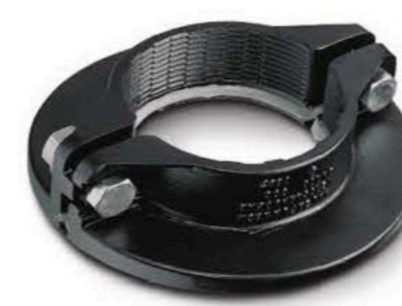
Bolted puddle flange for ductile iron pipes