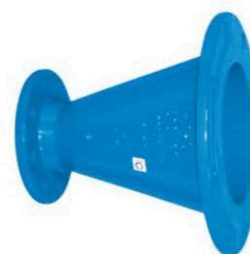
FFR double flanged reducer