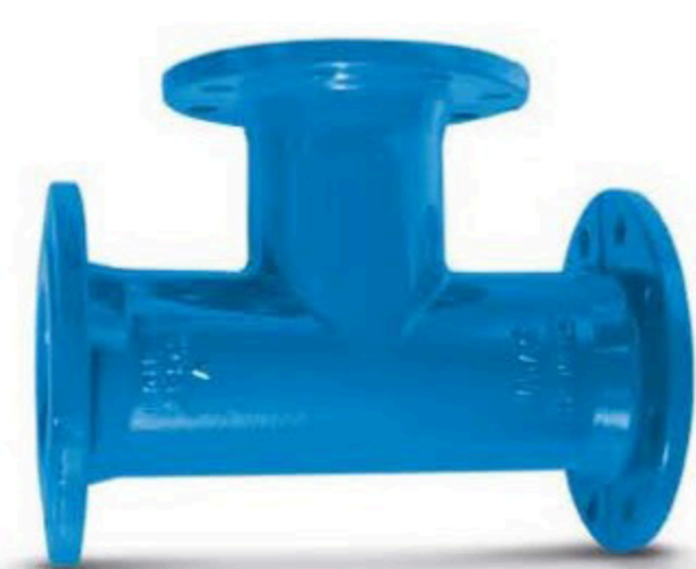
T all flanged tee