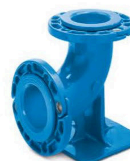
N flanged 90° duckfoot bend with two rotatable flanges