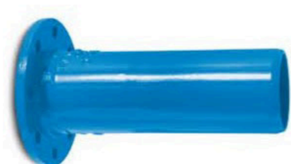
F flanged spigot