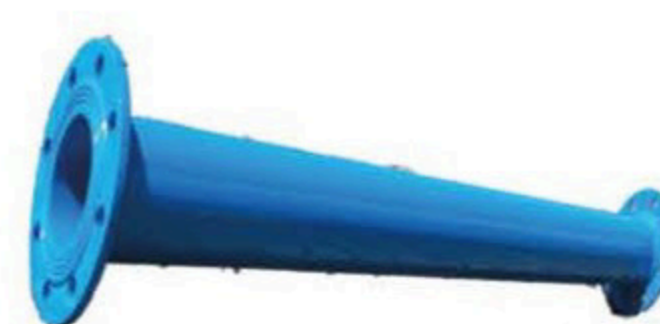
FFS double flanged pipe custom made with welded flanges