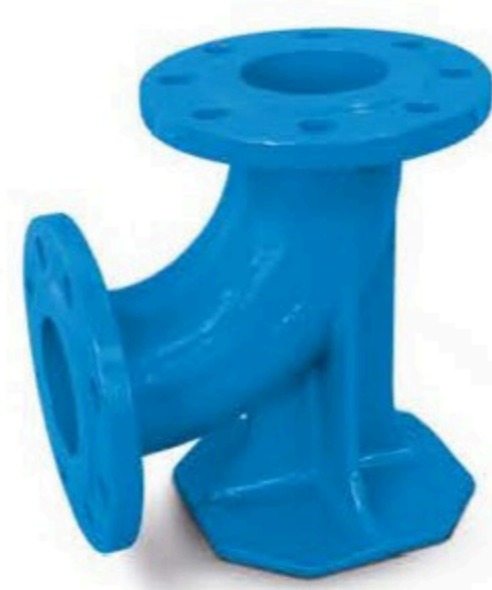
N flanged 90° duckfoot bend