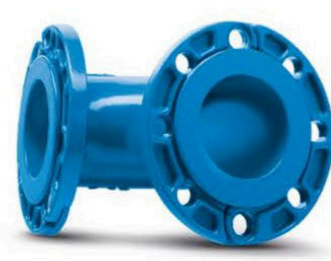
Q double flanged elbow with two rotatable flanges