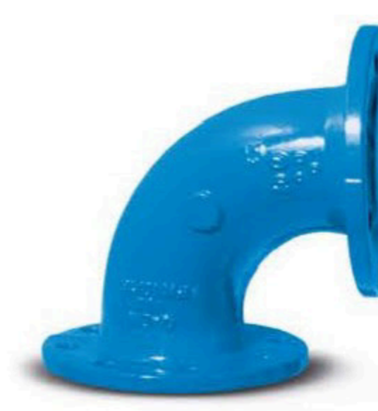
Q double flanged elbow