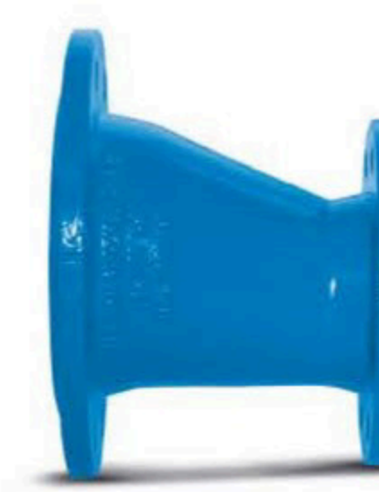
FFRe double flanged reducer eccentric