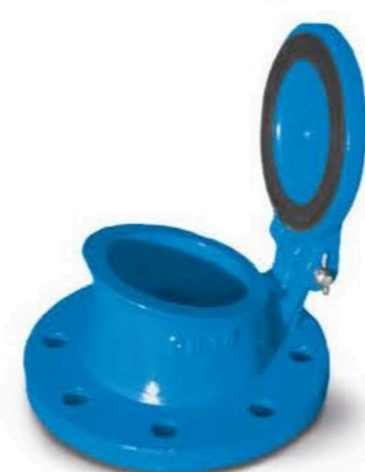
Flap check valve for the protection of drainage pipes