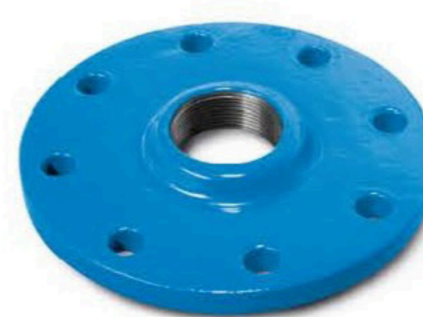
XIN blind flange with internal thread and boss