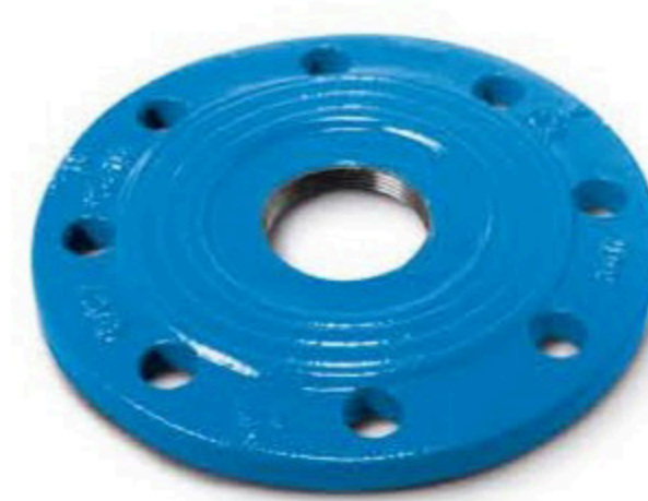
XI blind flange with internal thread