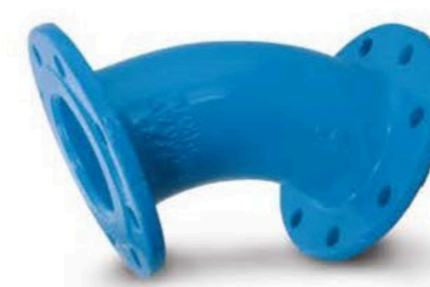
FFK 11° 22° 30° 45° double flanged pipe bend