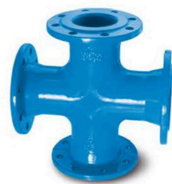
TT all flanged cross tee