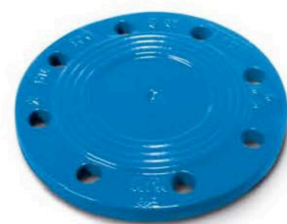
X blind flange