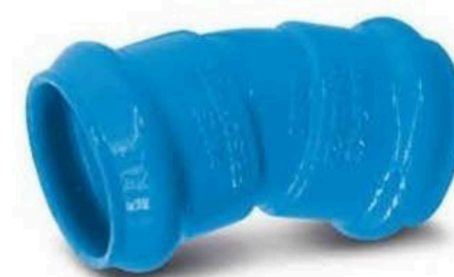
MMK-KS 11° 22° 30° 45° double-socket bend