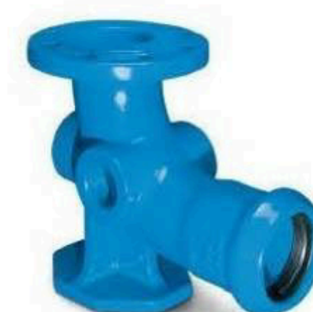
EN-KS hydrant duckfoot bend 90° with optional bosses