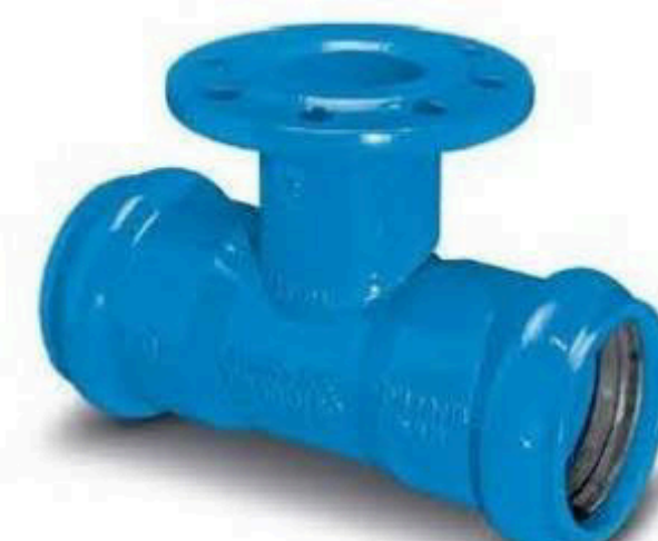
MMA-KS double-socket T with flanged branch