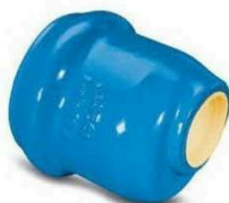
EXI-KS end cap with internal thread