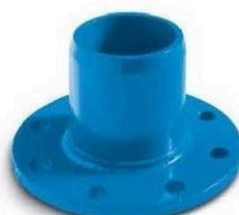
F-KS flanged spigot