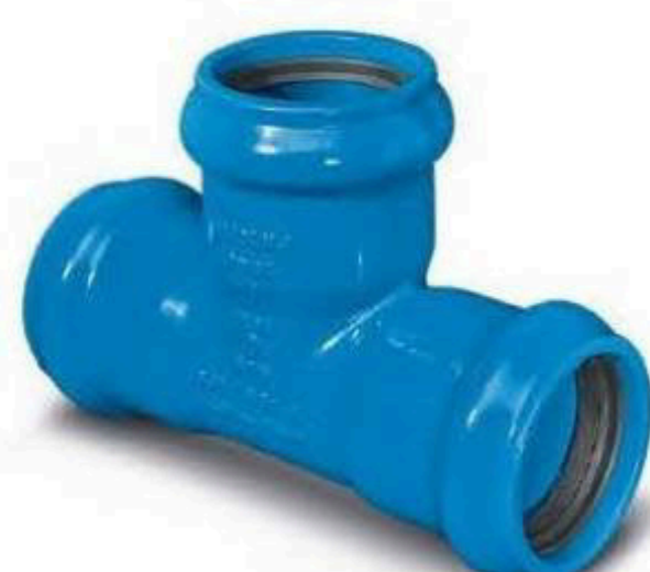
MMB-KS double-socket T with socket branch