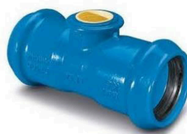
MMI-KS double-socket T with internal thread