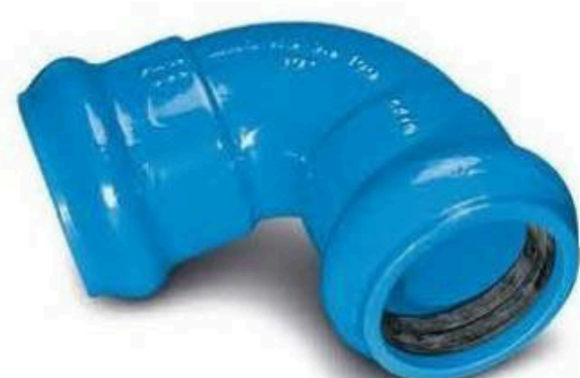
MMQ-KS double-socket elbow