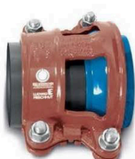
Frischhut restraining clamp for PVC and PE pipes