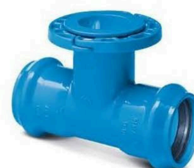
MMA-KS double-socket T with rotatable flanged branch