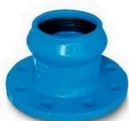
E-KS flanged socket