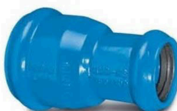
MMR-KS double-socket reducer