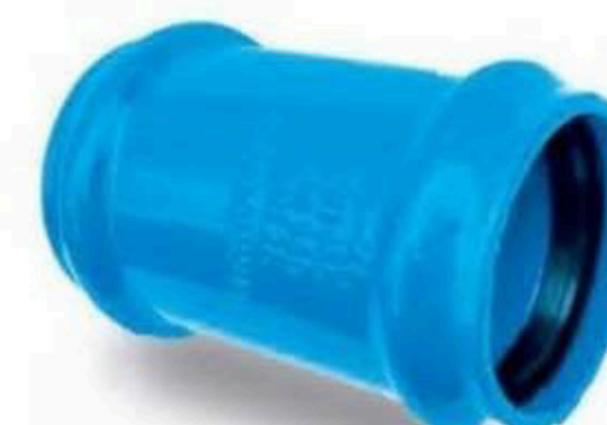
U-KS double-sliding socket