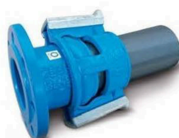
Frischhut restraining clamp type SL for PVC and PE pipes